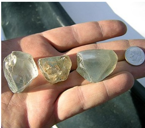
Topaz's, Topaz Mountain Gem Mine, Colorado

Topaz also undergoes radiation treatment. Here colorless and greenish brown crystals can be irradiated to produce a variety of colors such as smoky-grey, cinnamon-brown, yellow-orange, and blue. The color depends on the time of exposure to the radiation. The most commonly used radiation process is gamma cobalt 60 radiation. Of note greenish-brown crystals can be irradiated to produce the popular and permanent blue colors, known as "London blue," "Swiss Blue" and "Sky blue." All irradiated topaz gems in the United States are processed in a special facility in Missouri to ensure that they conform to strict safety standards. All imported blue topaz are also subjected to this examination before they are released to the importers.