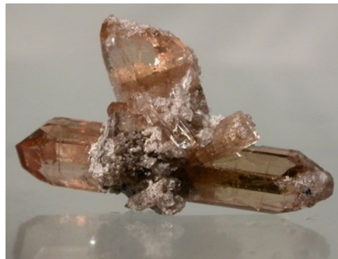
Topaz, Juab County, Utah

In the U.S., the most well-known Topaz occurrence is the Thomas Range, Juab Co., Utah, especially Topaz Mountain and Maynard's Claim. Here sherry colored crystals with good terminations are associated with a rhyolite matrix. Green colored Topaz crystals are found at the Zapot Mine, near Hawthorne, Nevada. Topaz is found in the gem pegmatites of San Diego County. Pikes Peak Co has produced areas with colorless, Blue, and Sherry colored Topaz. Fine colorless and light blue tabular crystals come from Mason Co., Texas Of note Topaz is the state gemstone of Texas and Utah.