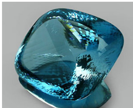
Swiss Blue Topaz, Brazil, irradiated, 7,860 carats

The most classic locality of blue Topaz is Murzinka, Ekaterinburg, in the Ural Mountains of Russia. Multicolored yellow and blue Topaz comes from Nerchinsk, Transbaikalia, Russia. Colorless and often etched crystals come from Volodarsk-Volynskii, Zhytomyr, Ukraine.