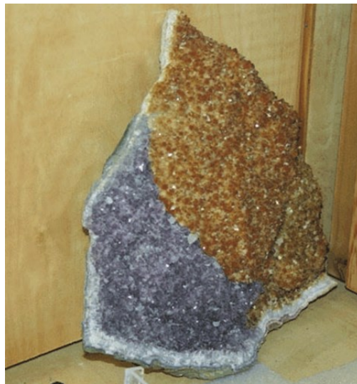
This is a plate of amethyst that has been split in two, with one side being heated to produce the orange color change, then, placed back together.

Corundum : Heating of corundum, both Ruby and Sapphire varieties is a common occurrence, not to change the color, but to enhance the transparency. Heat causes structural changes in "silk" inclusions in ruby and sapphire. The rutile which forms the silk dissolves into the stone at high temperature (somewhere around 1800 degrees centigrade). Thus leaving a more transparent stone. Unheated rubies