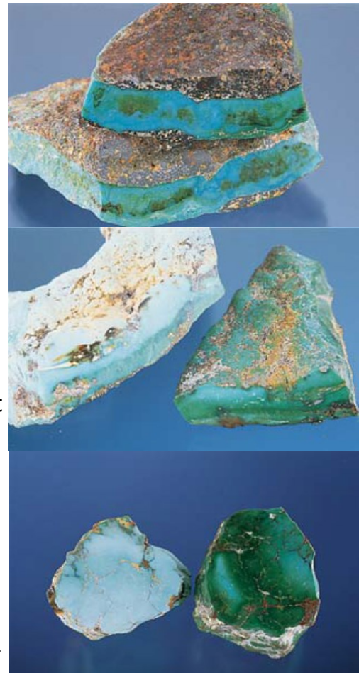
Emerald Valley Turquoise. Illustrating the results of treatment via the Zachery Process. Half was untreated, with the darker stone the treated stone. Little change is visible in the treated half (top) of the high quality (low-porosity) material. The medium quality turquoise shows distinctly higher color saturation in the treated half. The low quality turquoise also shows distinct color saturation.

Zachery Process (or Sterling Process, or the present Colbaugh Process) on Turquoise. James E. Zachery developed a method of treating Turquoise which does not use any type of Dyes (organic or inorganic), it also does not impregnate the turquoise with plastic, resin, wax, nor lacquer. What it does is that it somehow enhances the micro crystalline structure. How is not known. The process is highly proprietary and Mr. Zachery nor the current owner of the Process will divulge what the process entails. What the process does is to take medium to lesser quality turquoise and improves the color to a deeper greenish color, makes it harder, lessens the porosity of the stones. The outcome is a very hard evenly colored piece of turquoise that can be used in jewelry.