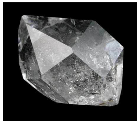
Herkimer Diamond, Ace of Diamond Mine, NY

"Herkimer Diamonds" is the name given to the doubly terminated quartz crystals found in Herkimer County, New York and surrounding areas. These crystals have the typical hexagonal habit of quartz, however, instead of having a termination only on one end, they are doubly terminated. This is a result of the crystals growing with very little or no contact with their host rock. Such doubly terminated crystals are not common, which makes Herkimer Diamonds popular with mineral collectors.