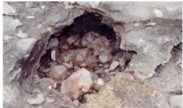
Herkimer Diamond Pocket, Ace of Diamond Mine, NY

One can find pieces of vuggy rock and break them open with a heavy hammer. If you are lucky the rock will break to reveal one or several Herkimer Diamonds within a cavity.