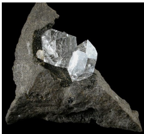
Herkimer Diamond, Ace of Diamond Mine, NY

The name Herkimer Diamond came about because to the sparkling crystals look like real diamonds and since these unique crystals are found in Herkimer County, named after the Revolutionary War General Nicholas Herkimer thus the name Herkimer Diamonds. Additionally, the Mohawk Indians which were native to this area, were known as "The People of the Crystals".