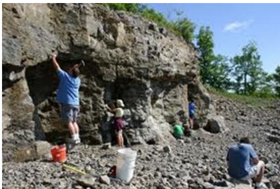
Herkimer Diamond Mine, NY

durable dolomite. No the object is not to beat the stone into submission, as you will find out quickly that you will lose. The object is to find fractures somewhere and use wedges and sledge hammers to try to break parts of the dolomite free.