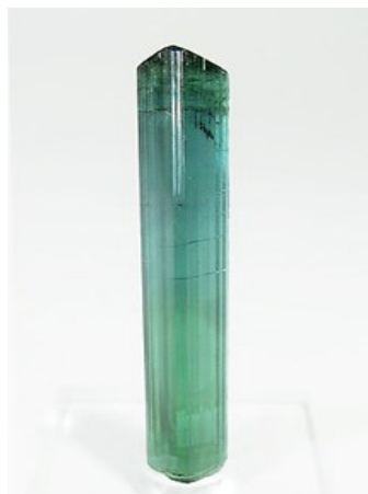
Elbaite, Minas Gerais, Brazil

Elbaite belongs to the Tourmaline group. Elbaite is also a mineral with a very broad