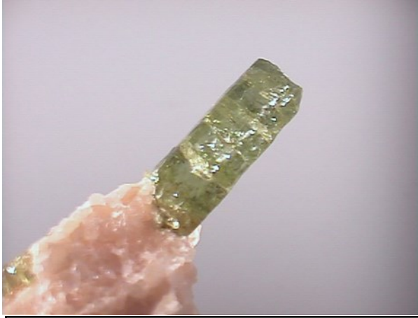
Apatite on Calcite, Wilberforce, Ontario, Canada

intermixed Green and Blue's which can also be found in the second tier of Opals.