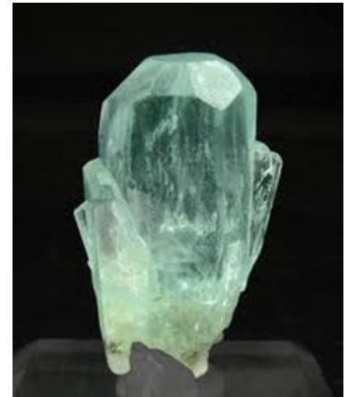
Aquamarine, Minas Gerais, Brazil

the Aquamarine. Oddly enough irradiating the same stone can reverse this process and restore the greenish color. Why anyone would want to do this, who knows, however it can be done. One of the largest known Aquamarine crystals was found in Brazil in the 1920's. It was 19" long and 16" wide, weighing in at an incredible 243 pounds, yes pounds, not carats.