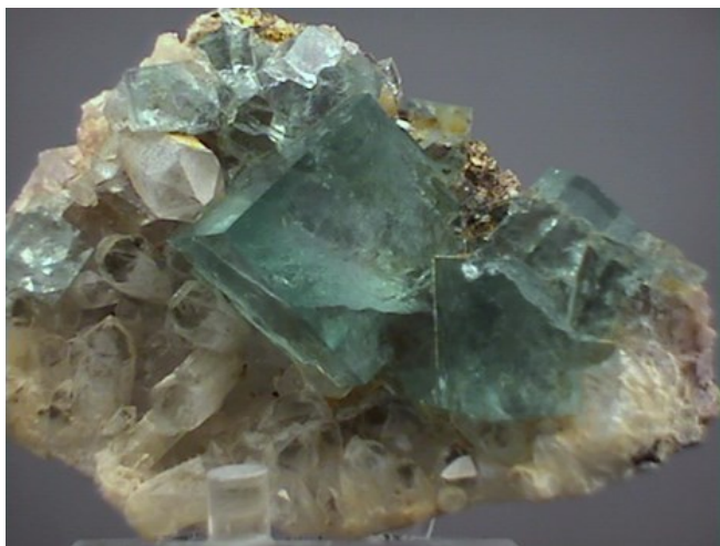
Flourite, Xianghualin, Mine, Hunan, China