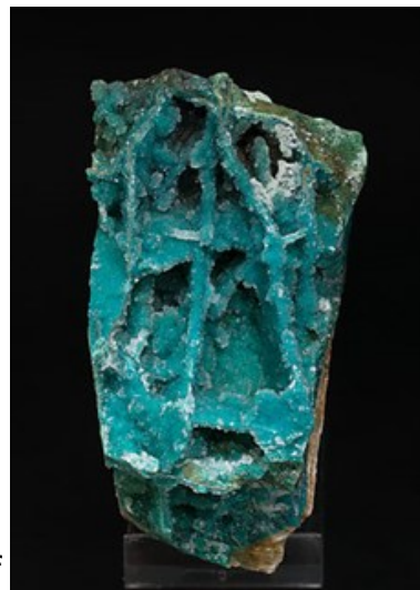
Chrysocolla with Quartz, Pisco Umay, Peru

Opal, this simple hydrated form of Silica, is found all over the world. Even in young places like Hawaii, Opal can be found in the vesicles of Lava. Albeit it is white common opal, but it is still opal. The Opal we are talking about in this case is the outstanding Black Opal from Lightning Ridge, Australia. The Reds are most coveted and beautiful. But not to be outdone are the flashes of