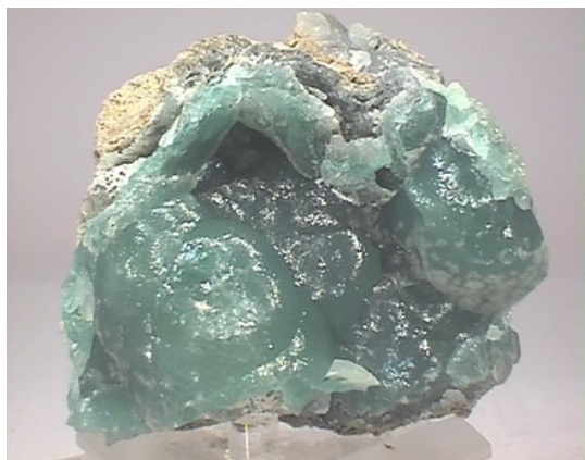
Smithsonite, Sinaloa, Mexico

Smithsonite is a Zinc Carbonate, which belongs to the Calcite Group. Smithsonite is named in honor of James Smithson, the founder of the Smithsonian Institution. When the Zinc is partially replaced by other minerals we get different colors of Smithsonite. Copper is responsible for green to blue coloring, Colbalt causes a pink to purple color, Cadmium makes Smithsonite yellow, and iron gives it a brown to reddish-