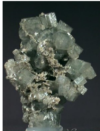
Apatite, Beira Baxia, Brazil

Flourite has been referred to as "the most colorful mineral in the world". Flourite comes in just about every color, in addition to fluorescing in many other colors under both long and short wave UV lights. Flourite can be similar to the softer Calcite and the harder Apatite.